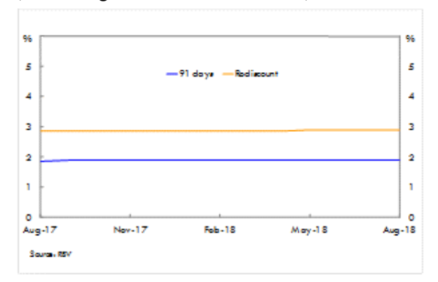
Chart 3 shows the yield on the 91-days<sup>5</sup> RBV notes. A total of VT1,900 million RBV notes matured in August 2018. The remaining balance declined to VT1,470 million compared to VT1,880 million reported in July.